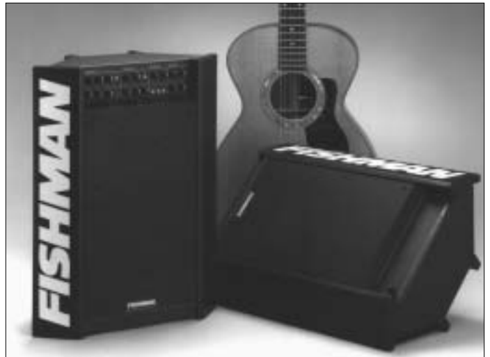
Fishman's compact, powerful Acoustic Performer Pro (left) and Fishman Acoustic Monitor Pro (right) deliver crisp, clear sound.

whacking the heck out of my guitar, I found it virtually impossible to get it to distort. This is very handy if you're a dynamic player, because you get a solid reverb effect regardless of how you approach the instrument. By the way, when the reverb is assigned to Channel 1, the signal from the aux/mic input is treated by the reverb.